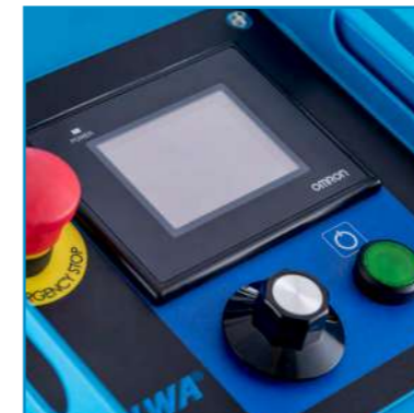
Innovative interface with easy operation