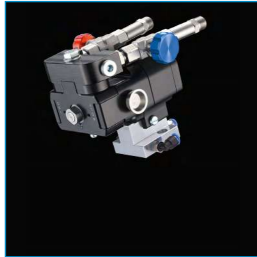
WIWA PU GUN 4040 automatic gun

With the development of the WIWA PU GUN 4040 , we are expanding our wide range of innovative PU application technology with our own spray gun.