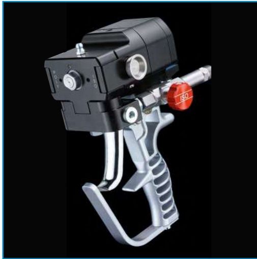
WIWA PU GUN 4040 manual gun