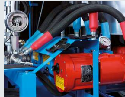
DUOMIX 333PFP material flow heater

In close cooperation with major material manufacturers, WIWA has developed plural component spraying equipment for passive fire protection applications.