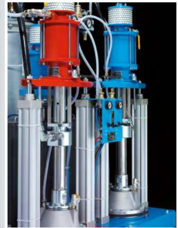
WIWA DUOMIX 333PFP rams