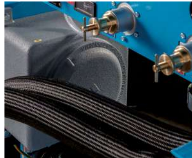
DUOMIX 333 PFP -Zone 1- control box