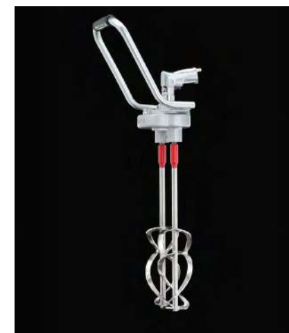
Pneumatic manual agitator with gearbox and two counter-rotating agitator shafts Order No. 0652214