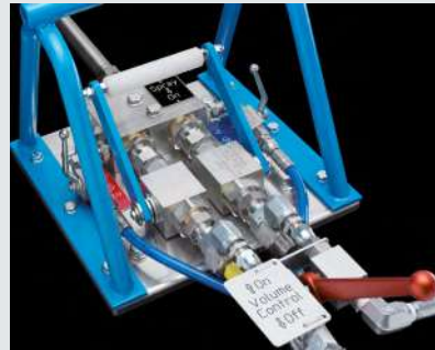
DUOMIX 333PFP mixing block