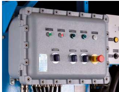
Pressure encapsulated housing