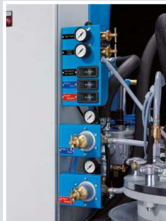
WIWA DUOMIX 333PFP control unit