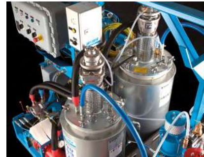
DUOMIX 333 PFP -Zone 1- pneumatic agitators

Lloyd's Register certified that one of our Duomix 333 PFP units satisfies the requirements for operation in a Zone 1 hazardous area as defined in BS EN 60079-10-1:2009. ATEX Designation CE II2Gc IIB T3.