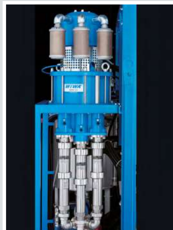
WIWA DUOMIX 333PFP main pump