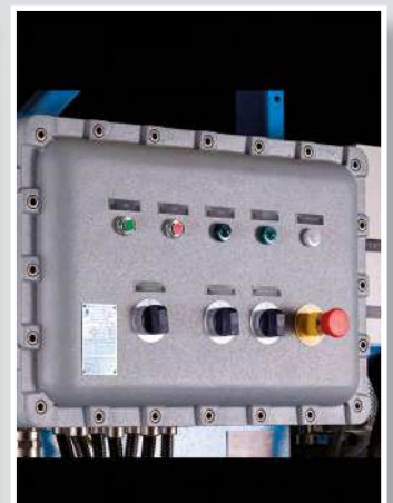
Pressure encapsulated housing