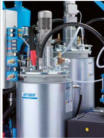
WIWA DUOMIX 333PFP pressure tank