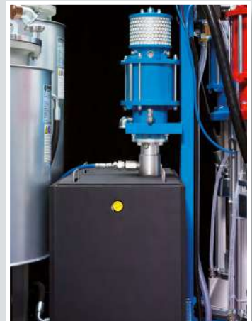
WIWA DUOMIX 333PFP flushing unit