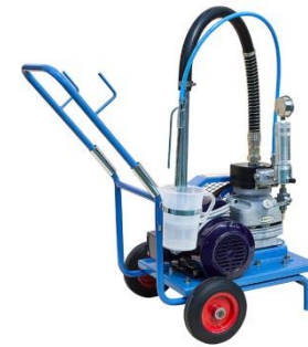
Electric Airless sprayer