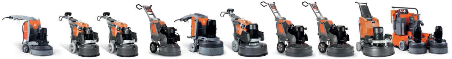
BMG 555 (3 plates) HTC T6/RT6 (3 plates) HTC X6/RX6 (4 plates) PG 690/690 RC (3 plates) BMG 780/780 RC (3 plates) HTC X8/RX8 (4 plates) PG 830 S (3 plates) PG 830/830 RC (3 plates) HTC 950 RX (4 plates) BMG 2200 (3 × 3 plates)