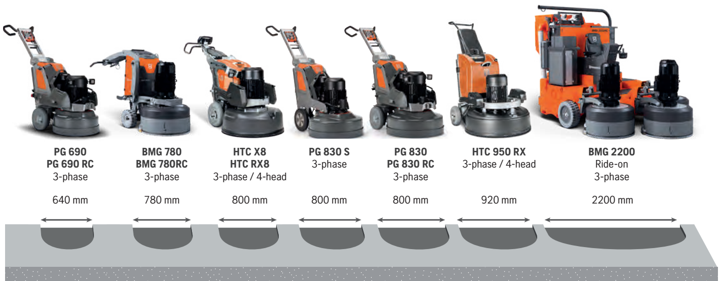
PG 690 PG 690 RC 3-phase 640 mm

Preparing, grinding and polishing of concrete floors as well as repairing and polishing of terrazzo and other natural stone, are demanding jobs. Our mission is to enable you to perform at your maximum potential by providing you with a wide range of large grinding machines, offering ingenious features and benefits to fit your needs.